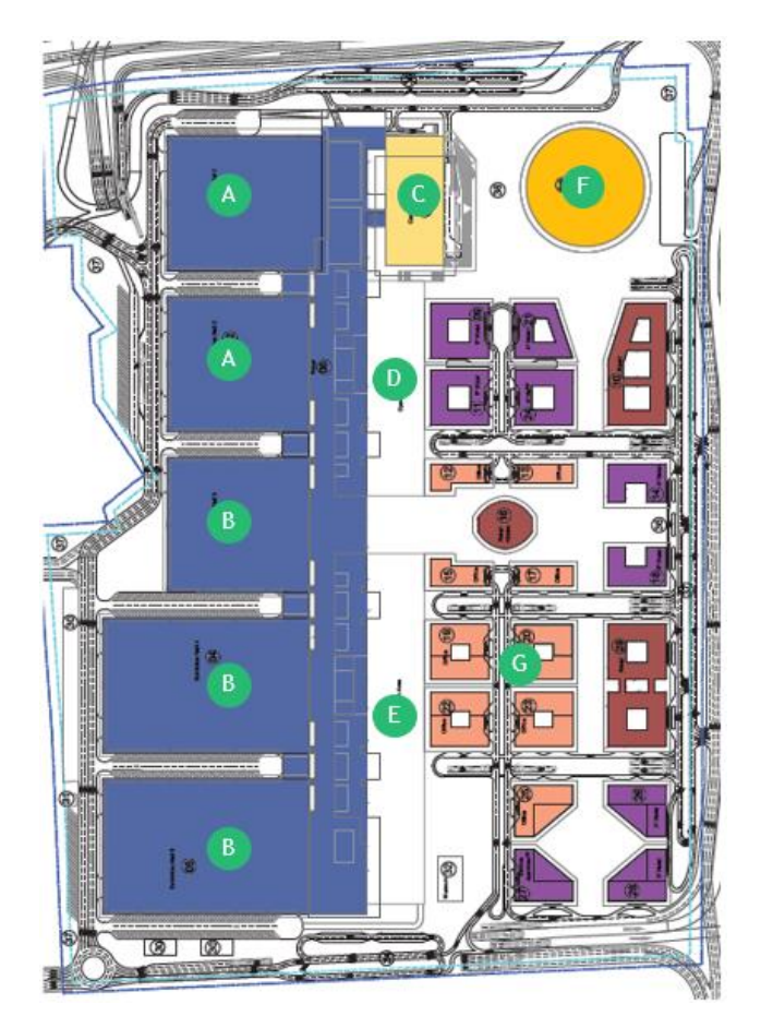
Fig. 2: Layout concept of IICC as per indicative master plan

1.1.5 The IICC district is proposed to include approximately 300,000 sq. m. of covered exhibition space (240,000 sq. m. of indoor exhibition space, 60,000 sq. m. of foyer space) and 60,000 sq. m. of convention space, as well as 50,000 sq. m. of outdoor exhibition space. In addition, it is planned to contain a sports arena of approximately 50,000 sq. m., approximately 260,000 sq. m. of hotel space, and approximately 380,000 sq. m. of commercial space for retail, entertainment and class-A offices. Approximately 28,000 basement-level car-parking spaces are also proposed. The size and diversity of the IICC suggests that each area will have unique features that define both the challenges and the opportunity to stimulate investment and generate a desirable level of success.